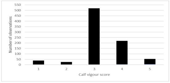
Figure 2. Distribution of calf vigour scores in Cohort One

Most calves were healthy or vigorous (87%), with a small number of calves observed to be extremely vigorous (6%) and extremely weak (4%) (Figure 2). The relationship between calf vigour scores at birth and subsequent measures of behaviour and production will be assessed.